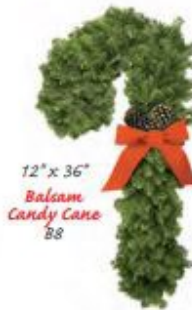
12" x 36" Balsam Candy Cane B8