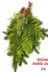
Mixed Noble Swing P4