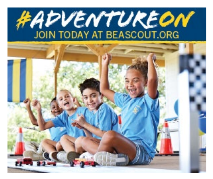
Dear Cub Scout Leader,

This guidebook will assist you and your pack with recruiting new families. This is one of many tools available to help you engage your community in an exciting conversation about Scouting, both with new and former families of the Scouting program. The more ideas used in your community, the more successful your results will be!