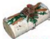
12" Holiday Yule Log P7