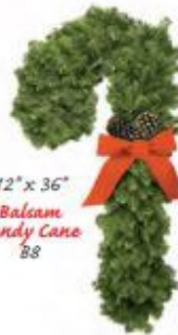
12" x 36" Balsam Candy Cane B8