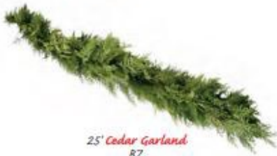
25' Cedar Garland B7