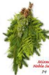
Mixed Noble Swag P4