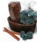
Fire Starter Basket P8

B Products primarily for outdoor use. P Products primarily for indoor and outdoor use.