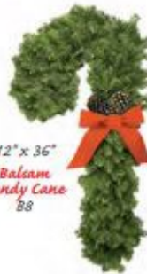
12" x 36" Balsam Candy Cane B8